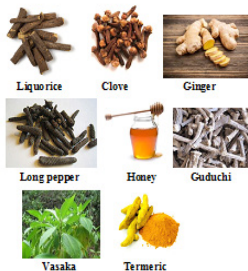
Figure 1: Herbal Ingredients used for Lazenges.

The polyherbal lozenges were developed by thorough study of herbs, followed by optimization of formulation dosage and evaluation of qualitative and quantitative analysis by precised advanced analytical instrumental methods for assessment. The effectiveness has been analyzed by a survey through questionnaire. The study carried out has endorsed the quality and effectiveness of the polyherbal lozenges. This study reveals that the lozenges are suitable dosage form for the symptomatic relief of cold and flu. The standardization which provides a specific and rapid tool for setting the quality standard, identity and reproducibility in herbal lozenges for cold and flu. Hence the lozenges pass all the parameters and was found to be more effective in the treatment of cold and flu (As per the survey on 100 patients). Hence this formulation can be recommended for patients having cold and flu symptoms.